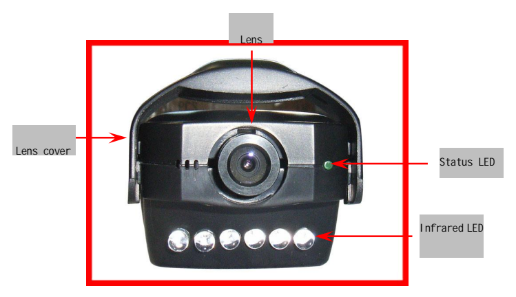
Figure 2. CAM77IP Network Camera Front View